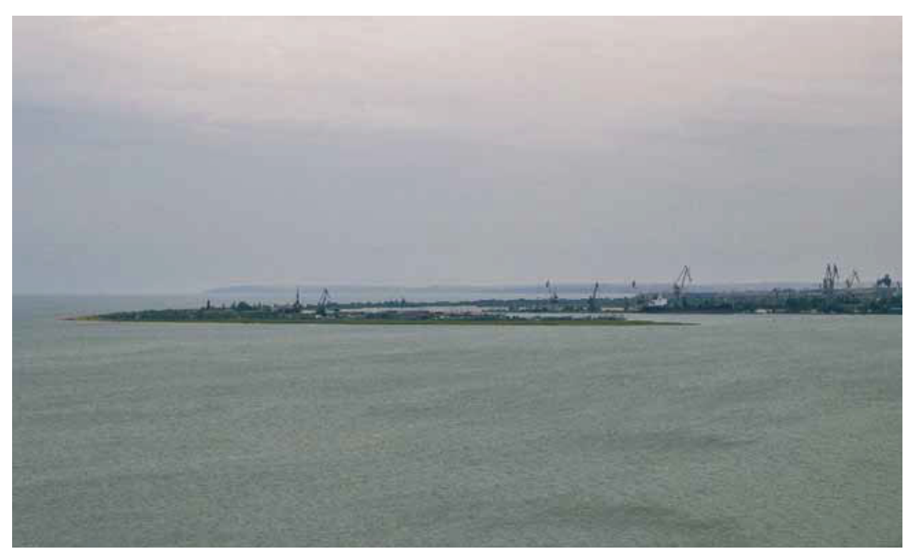
Industry in Kerch

areas and held numerous meetings with ministries at national and local levels. In the report of the MIC team, the situation observed on the field was described as follows: