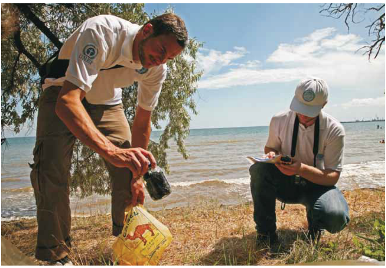
UNEP experts collecting samples from contaminated materials found on the shoreline

This report summarizes the findings of the PDNA team and provides a set of concrete recommendations for recovery and disaster risk reduction in Ukraine. It has been prepared by the EC-UNEP team with the participation of the Government of Ukraine.